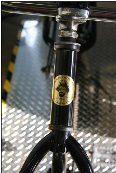
Robert Morgan Educational Center students are proud of their school!